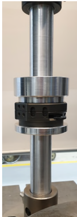
Figure 2: Test setup

The tool exchanger was tested while locked together. The testing rate was 1mm/min constant speed.